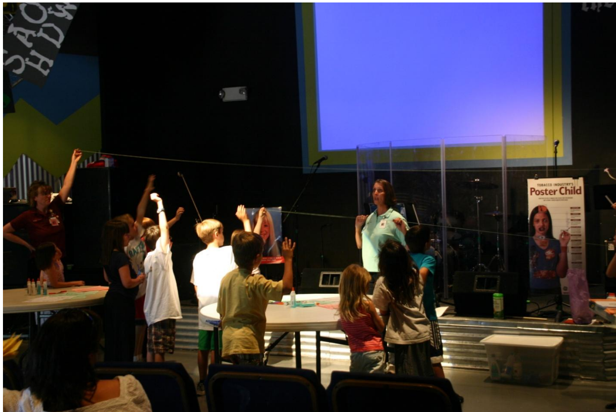
MASK's "Dangers of Smoking" Presentation for Parents and Children

including but not limited to, current drug and alcohol trends, internet safety, eating disorders, depression, bullying, peer to peer relationships and the dangers of smoking. The mission of MASK is to increase awareness among parents and children – with the goal of improving communication with our children. MASK also gives parents an opportunity to network and share tools that focus on prevention and promote healthy peer relationships. Monthly meetings are generally attended by parents only. However, MASK will often design sessions where both parents and children are asked to participate.